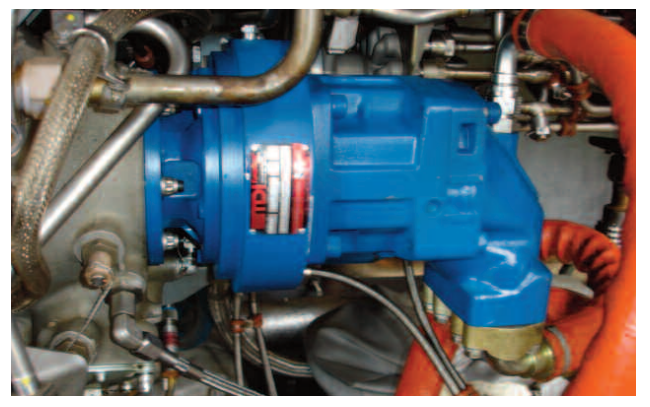
56H hydraulic starter

56H's hydraulic system releases no fugitive emissions. It is a good solution where strict clean air regulations are enforced.