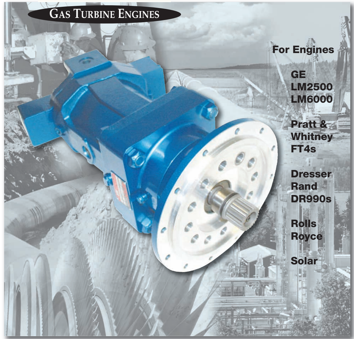
Many Custom Configurations to Fit Your Specific Application