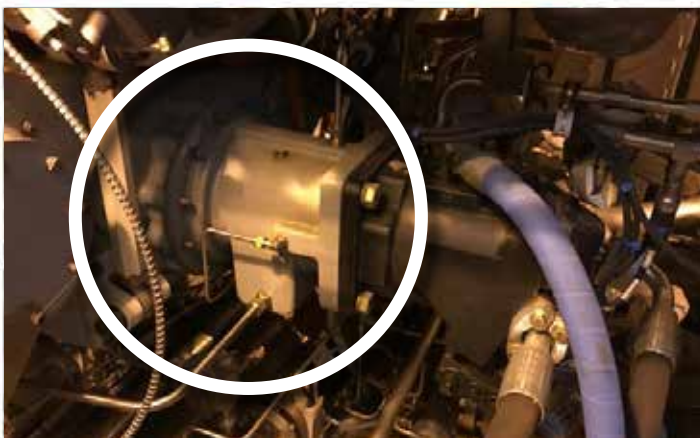
Before (Showing Hilliard Clutch)

56H's hydraulic system releases no fugitive emissions. It is a good solution where strict clean air regulations are enforced.